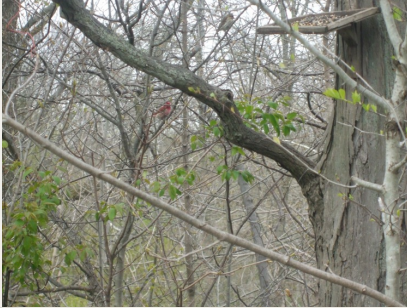
A (breeding?) pair of Purple Finches can barely be discerned in this image of the Gallery Forest understorey.