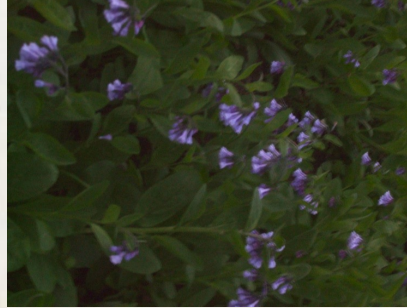
I call this masterpiece, "Bluebells by Night"