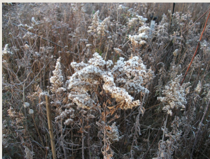
Hoar frosts the spent flower heads of goldenrod.early monday. morning Melosira granulata is a common filamentous diatom in at the Lower Rapids, mingling with Cladophora within the "rock hair."