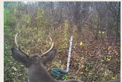
Stealth Cam 10/24/2010 17:47:28 ● 39F Note that time function on cam still hasn't been fixed. Actual time of shot was 10/31/2010 10:20:28 -- this very morning. Buck is facing in direction of trailer.