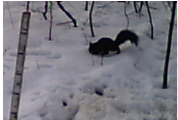
Eastern Gray Squirrel forages in snow