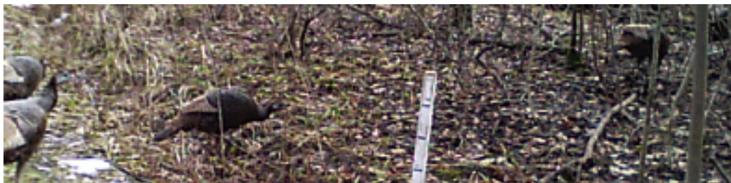
Wild Turkeys perform a march-past