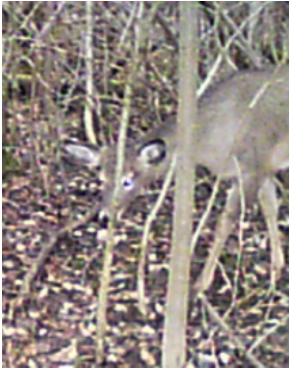
Virginia Deer peeks shyly into frame