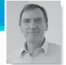
Clifford Cocks (Born 1950)